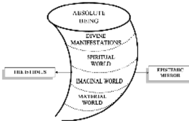
Figure 2. Ibn 'Arabī's Concept of Creative Imagination.